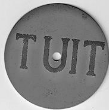
For those people who cannot seem to get around to it.