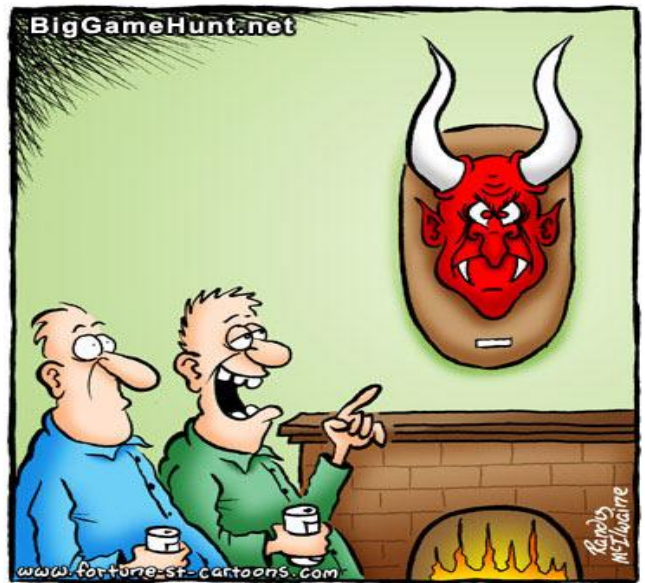
"I know I'll pay for it in the end, but, seriously, how could I resist a rack like that?"